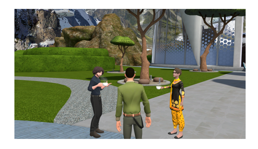
Page 6 of 9

Change the viewing mode to Third-Person by pressing F1 on our keyboard. This mode depicts a field of vision from a vantage point just behind your avatar. This mode is less immersive, but allows you to see yourself (most of the time), and see more of the environment.